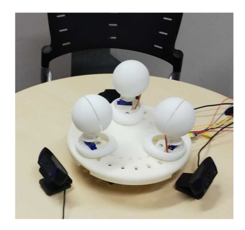
Figure 1. Table-top robot system prototype using specialized face-tracker software to 'mimic' users' non-verbal behaviors.

The system was evaluated in a series of group discussion experiments, where participants with disparate language abilities discussed a given topic. The results suggested that the table-top robot system influenced both native and non-native speakers' awareness of their own as well as other group members' non-verbal communicative behaviors, and that these awareness effects persisted in subsequent face-to-face discussion sessions without the support system. This indicated that the type of feedback provided by the table-top robot system could be used to influence long-term non-verbal behaviors of users during face-to-face meetings.