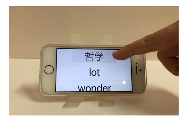
Figure 2. Mobile application that automatically detects, displays and translates difficult second language words during face-to-face meetings based on user's second language ability.

Development of a mobile application that automatically detects, displays and translates difficult to understand second language words during face-to-face meetings based on the user's second language ability was completed (Figure 2). The objective was to provide non-native speakers a method to check their understanding of second language words used by native speakers in an alternative modality, and quickly resolve any comprehension problems that might occur, and thus aid their contribution to the multilingual discussion without increasing their mental workload.